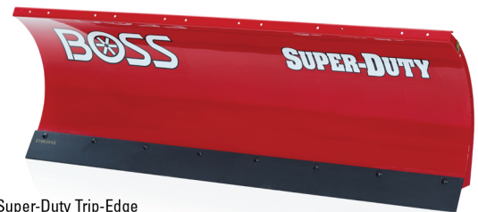
8' Super-Duty Trip-Edge Steel Skid Steer